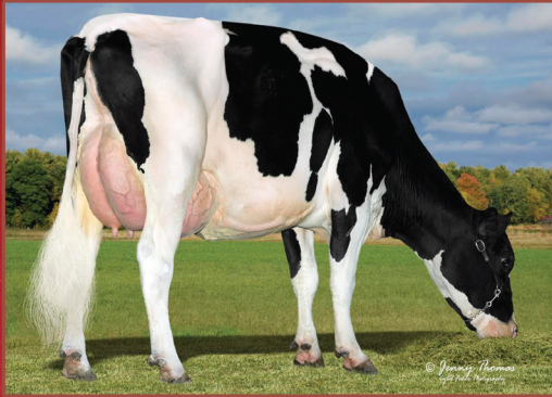
S-S-I Mont 8828 10817-ET GP-81 #3 Top GTPI Cow +2800 GTPI