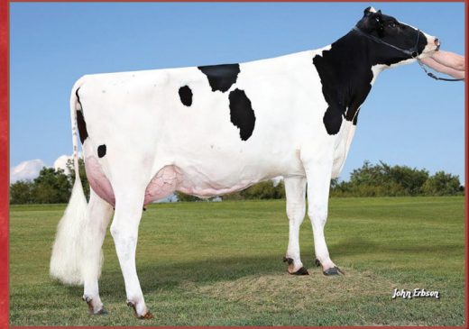
Plain-Knoll Mogul Mariah VG-88 #23 Top GTPI Cow +2663 GTPI Daughters currently in our IVF program Dam of King Royal (below), 507HO13504 Jaguar & 7HO12868 Advance