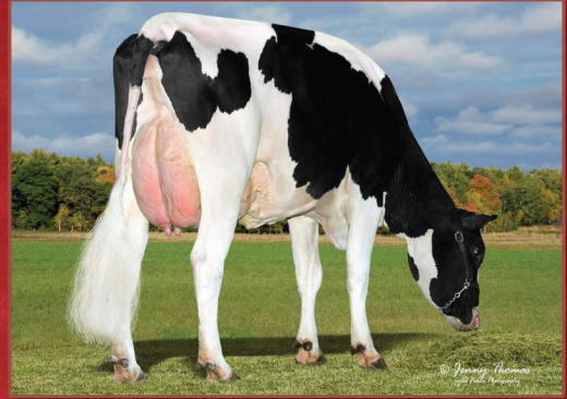
S-S-I Mont 8646 10720-ET GP-83 #7 Top GTPI Cow +2728 GTPI