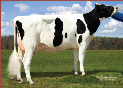
S-S-I Mont 8538 10743-ET GP-82 #18 Top GTPI Cow +2687 GTPI