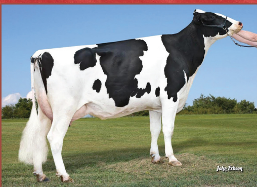
S-S-I Uno Mara 8395-ET VG-86 Dam of Plain-Knoll Jedi Flyer-ET 7HO13731 +2909 GTPI Watch for him at Select Sires!